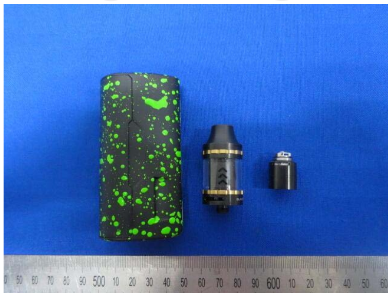
Sunog-S RTA with 0.4ohm coil /0.15ohm coil