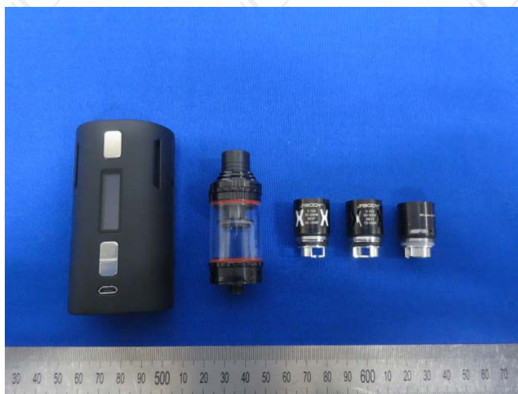
0.15ohm for Quad coils OCC/ DIY for RBA coil 0.25ohm/ 0.15ohm for single coil OCC