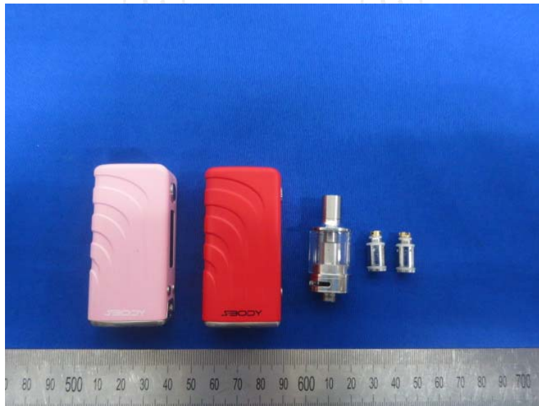
Elfin 50W Kit with 0.5ohm(Regular) / 0.2ohm(Ni200)